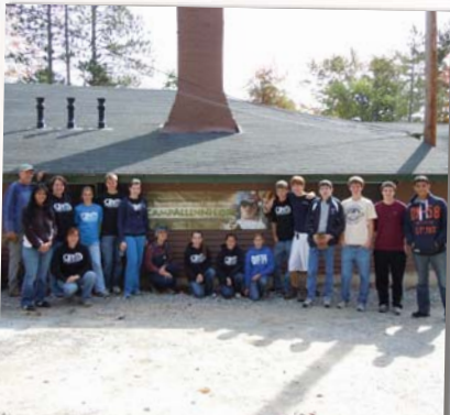
CENTRIX BANK & CAMP ALLEN CLEAN-UP