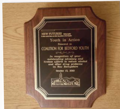
YOUTH IN ACTION AWARD