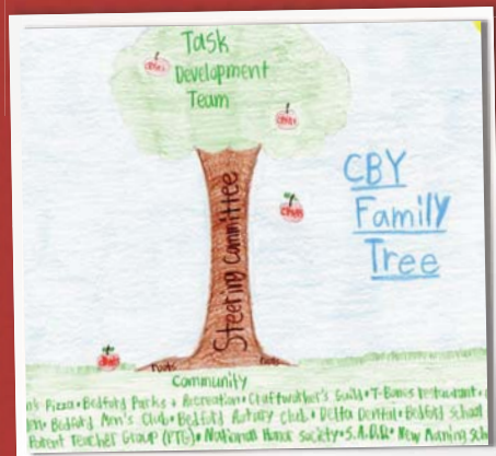
SEARCH INSTITUTE SURVEY RESULTS- BEDFORD, NH