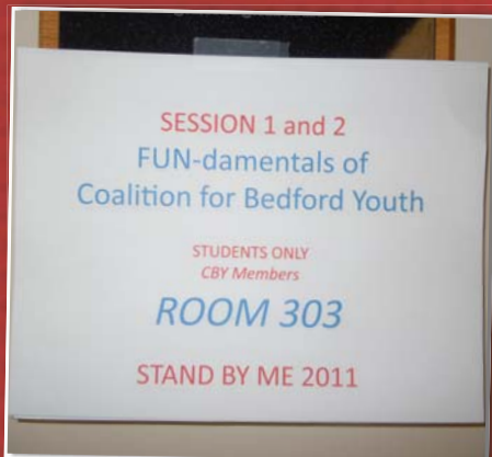
STAND BY ME